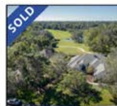
1947 Medinah Lane