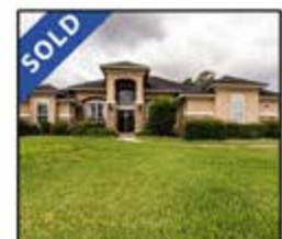
3407 Olympic Drive