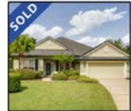
3762 Constancia Drive