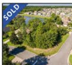
Wooded Magnolia Lot