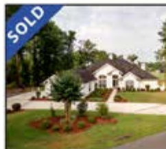
1935 Colonial Drive