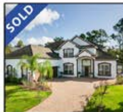
3545 Oglebay Drive