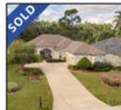
3508 Olympic Drive