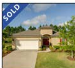
3358 Shinnecock Lane