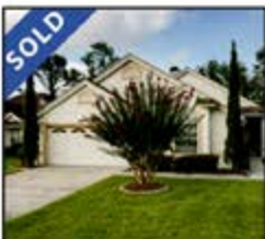
3747 Constancia Drive