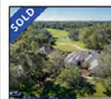
1947 Medinah Lane