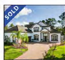
3545 Oglebay Drive