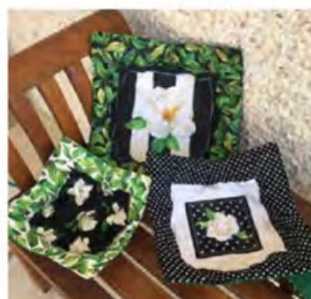
Cozies for Microwave Dishes