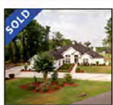
1935 Colonial Drive