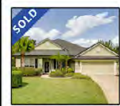
3762 Constanica Drive