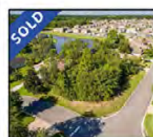
Wooded Magnolia Lot