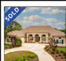
3696 Winged Foot Circle