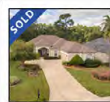
3508 Olympic Drive