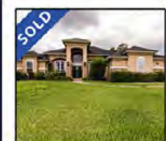
3407 Olympic Drive