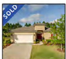
3358 Shinnecock Lane