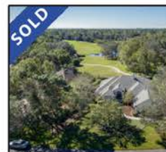
1947 Medinah Lane