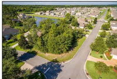
WOODED MAGNOLIA LOT One of the few remaining lots for sale in Magnolia Point. $59,900 Call Ron