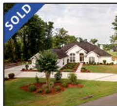
1935 Colonial Drive