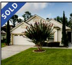
3747 Constancia Drive