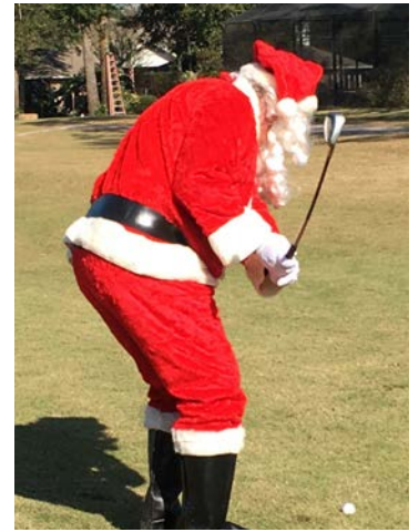
Santa on the course giving instructions to the ladies.