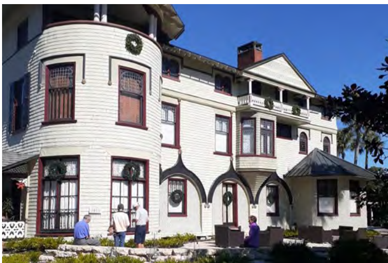
The Stetson Mansion