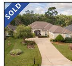
3407 Olympic Drive