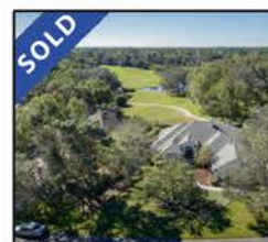
1947 Medinah Lane