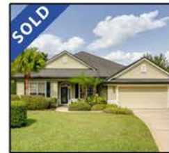
3762 Constancia Drive