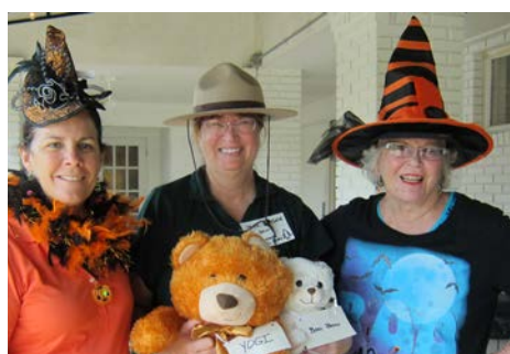
We enjoy golf and have fun on the course.