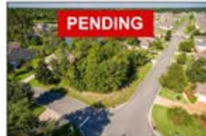
WOODED MAGNOLIA LOT $59,900