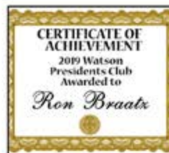
Certificate of Achievement