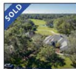
1947 Medinah Lane