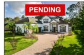
3545 OGLEBAY DRIVE $595,000