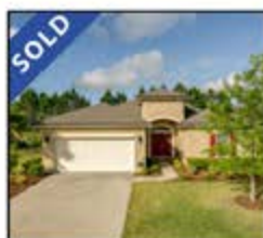
3358 Shinnecock Lane