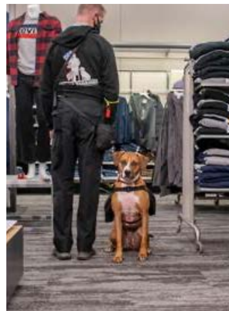
On the job in a clothing store with his trainer.