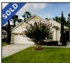
3747 Constancia Drive