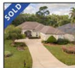
3508 Olympic Drive