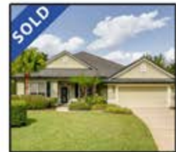
3762 Constancia Drive