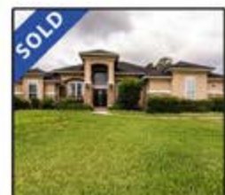
3407 Olympic Drive