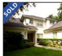
1856 Colonial Drive