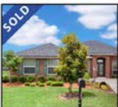
2012 Wedge Court