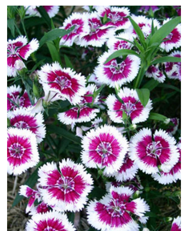
Clockwise from top left:

Azaleas, Camellias, Crinum, Dianthus, Pansies, Snapdragons