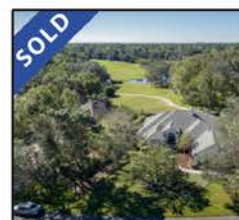
1947 Medinah Lane