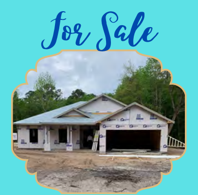
New GCS Construction