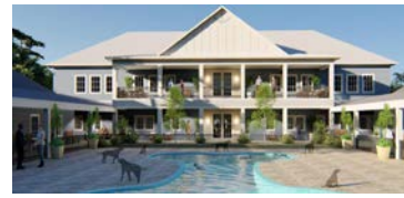
Chartrand Warrior Resource Center

the first time on location at Camp K9, the main campus for K9s for Warriors located in Ponte Vedra.