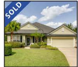
3762 Constancia Drive