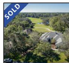
1947 Medinah Lane