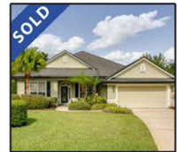
3762 Constancia Drive