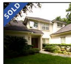
1856 Colonial Drive