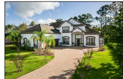
3545 OGLEBAY DRIVE 4,026 Sq. Ft, Pool, 3 Car Garage On Magnolia Point Golf Course $595,000 Call Ron