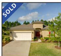
3358 Shinnecock Lane