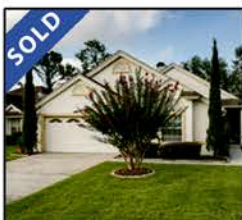
3747 Constancia Drive