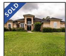
3407 Olympic Drive