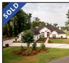
1935 Colonial Drive