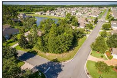
WOODED MAGNOLIA LOT One of the few remaining lots for sale in Magnolia Point. $59,900 Call Ron