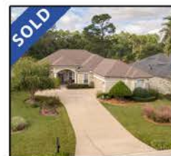
3508 Olympic Drive