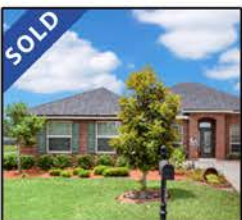
2012 Wedge Court