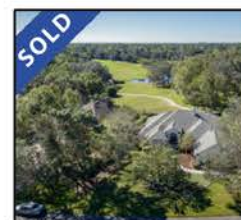
1947 Medinah Lane