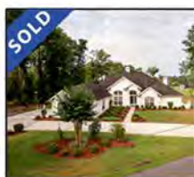
1935 Colonial Drive