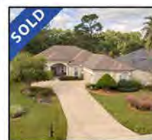
3508 Olympic Drive