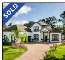
3545 Oglebay Drive