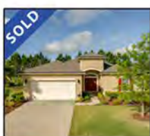
3358 Shinnecock Lane