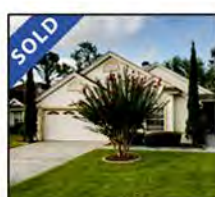
3747 Constanica Drive