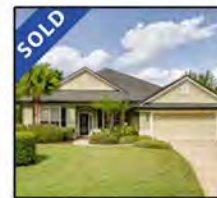
3762 Constanica Drive