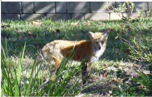
Rules Official – Mr. Fox