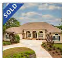
3696 Winged Foot Circle