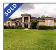
3407 Olympic Drive