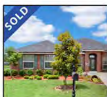
2012 Wedge Court