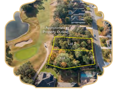
Lot 1 & 2 Oglebay $125,000 each Magnolia Point