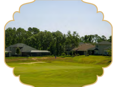
Lot 63, Medinah Lane $110,000 Magnolia Point