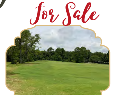
1716 Muirfield Drive $130,000 Magnolia Point